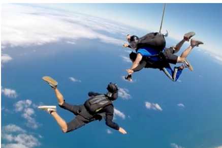
15,000ft Skydive From $355