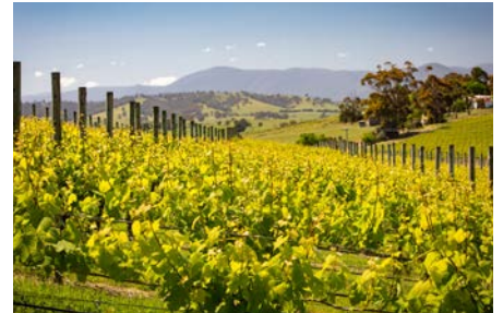
Yarra Valley wine tasting From $99