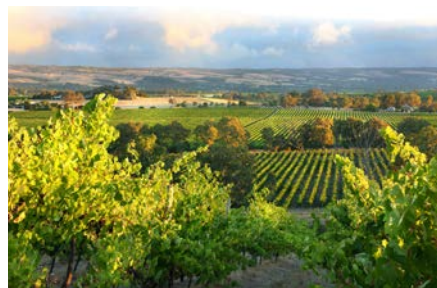
Victor Harbour & McLaren Vale day tour From $115