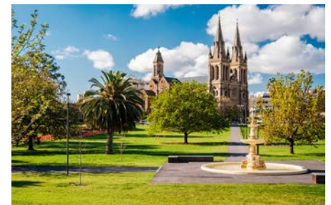
Adelaide City Highlights From $70