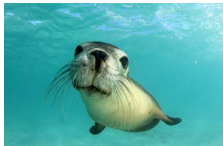
Swim with sea lions