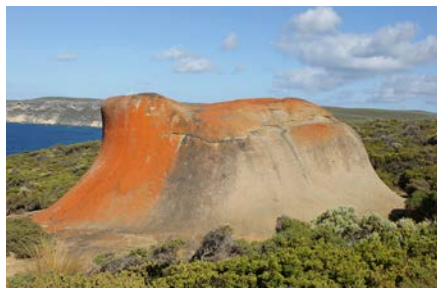
Kangaroo Island day trip From $299