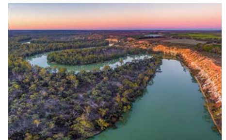
3-Night Murray River Cruise From $836