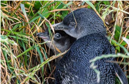
Philipp Island day trip From $139