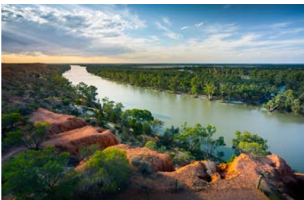
Murray River cruise From $165