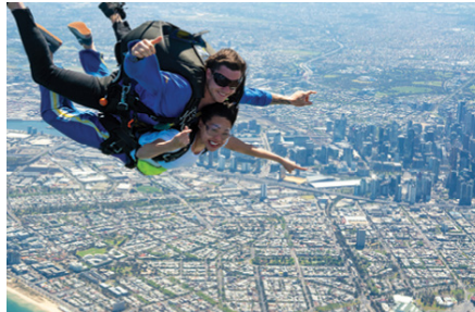
15,000 ft Skydive From $410