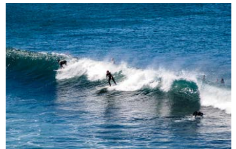
2hr Surf Lessons From $75