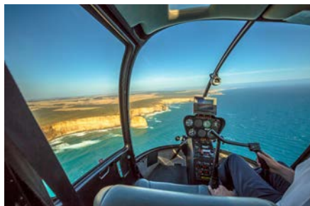
Helicopter flight From $145