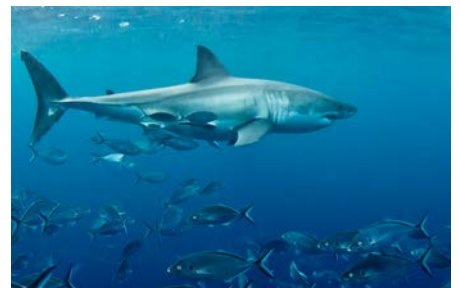
Shark & Sea Lion Combo