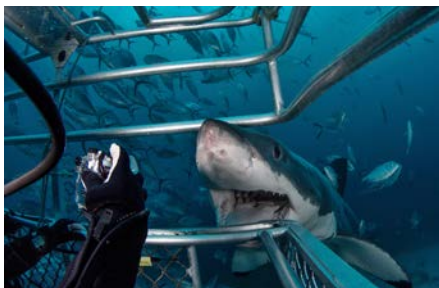
Great White Shark cage dive