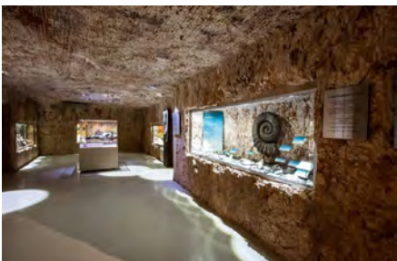
Umoona Opal Mine Museum & Tour From $18