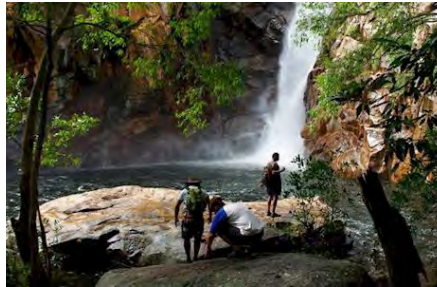
Two-day Kakadu Adventure Tour From $245