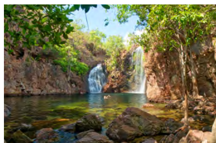
Litchfield National Park Waterfalls From $187