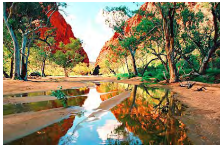
West MacDonnell highlights From $145