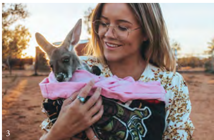
The Kangaroo Sanctuary From $85