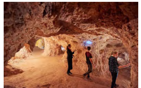
Desert Cave Tour From $82