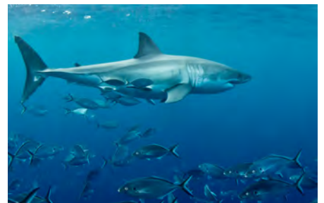
Shark & Sea Lion Combo From $679