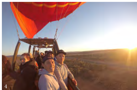
Hot Air Balloon Flight From $305