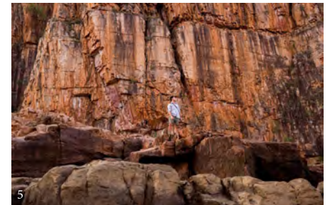
Half-day West MacDonnell tour From $79