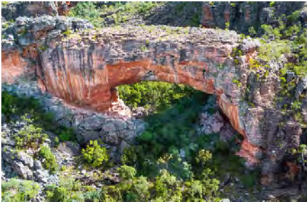
Kakadu helicopter flights From $145