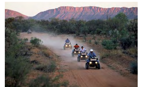
Quad Bike Adventure, From $140