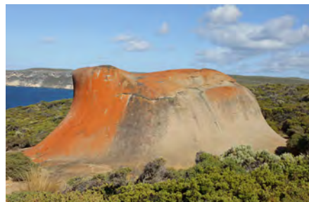
Kangaroo Island day trip From $299