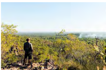
Pure Litchfield National Park Day Tour From $225