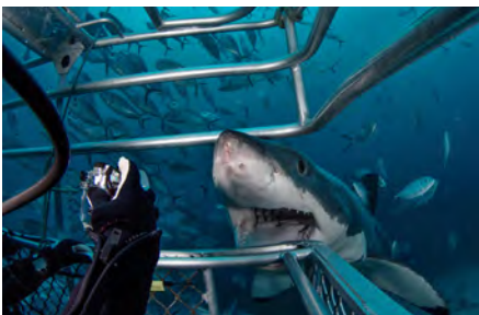
Great White Shark cage dive From $530