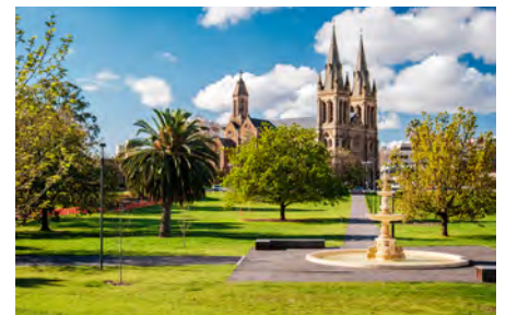
Adelaide City Highlights From $70