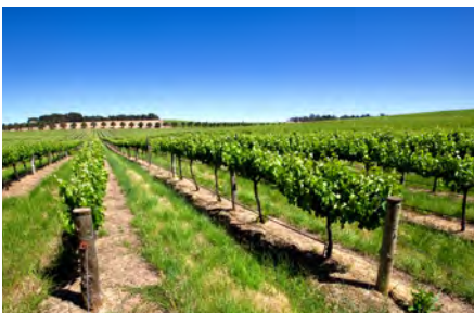
Barossa Valley food & wine tour From $100