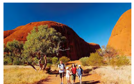
Kata Tjuta Sunset tour From $108