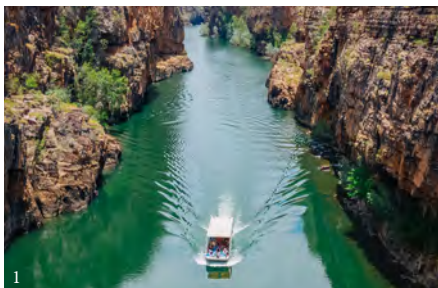
Katherine Gorge Cruise & Edith Falls