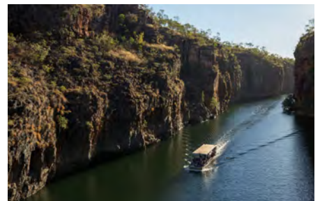
NitNit Dreaming Two Gorge Tour