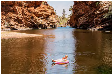
West MacDonnell Ranges Day Tour From $135