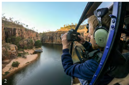
Nitmiluk helicopter flight