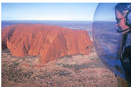
Uluru helicopter flights From $160