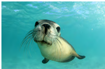
Swim with sea lions From $195