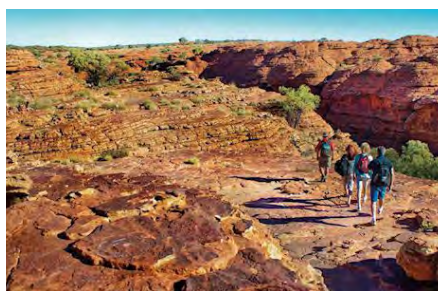
Kings Canyon Outback & Panoramas From $239