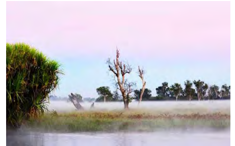
`Colours of Kakadu` Ethical 2-day tour From $1.950