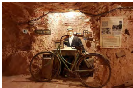
Old Timers Museum From $15